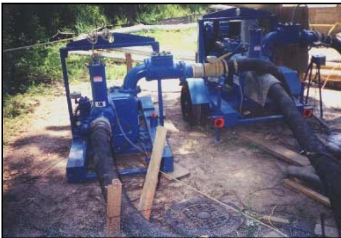
3-Million gallons per day double bypass for a pump station project in Odessa, Delaware, using pumps with exclusive ENVIOPRIME® Priming System.