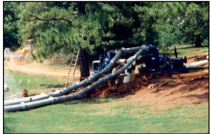
14-Million gallons per day bypass of sewer system in Greenville, South Carolina.