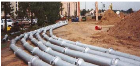
TPM Galvanized Pipe