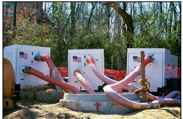
12-Million gallon per day sewer bypass and replacement application in Atlanta, GA using Sound Attenuated Silent Knight® Pumps.

In the interest of product improvement, we reserve the right to change specifications without incurring any obligation for equipment previously or subsequently sold. Capacity and Head are shown for comparative purposes. Consult engineering data for exact capabilities.