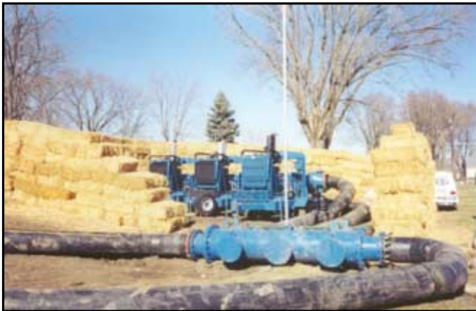
30-Million gallons per day major pipeline bypass into wastewater treatment plant in Middletown, Ohio.

We have proven to be an expert source when it comes to bypass systems and bypass applications. With a dedicated Applied Products department, we have the equipment, the resources, and the experience to make any bypass application a success.